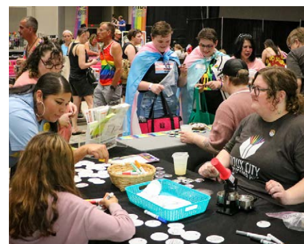
(Top) The Library attends a pop-up park event at Riverside Park. (Bottom) Attendees visited the Library booth at the SUX Pride event.