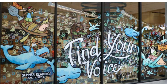
(Above) Painted window murals were created at all three Library locations. (Right and Below) Therapy dogs provided comforting listeners for well-attended Read-to-Me-Dogs events at Aalfs Downtown Library.