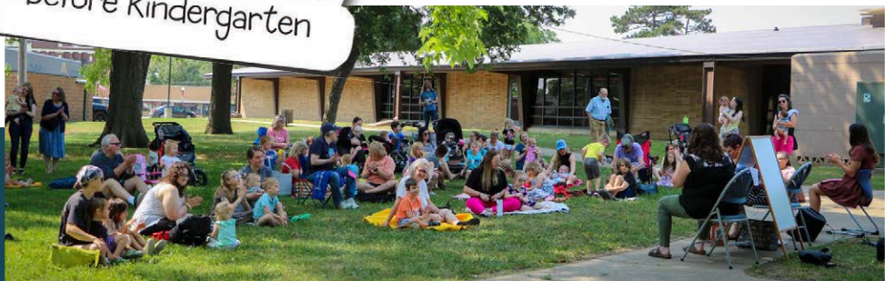
(Above) Families enjoy an outdoor storytime at Morningside Branch Library. (Below) Kids attend the First Saturday Storytime: Jammie Jam event.