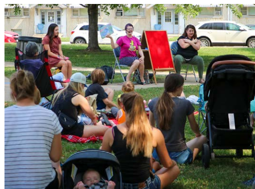
Storytimes held weekly at Perry Creek and Morningside Branch Libraries were often held outside. A volunteer provided sign language interpretation at Morningside.