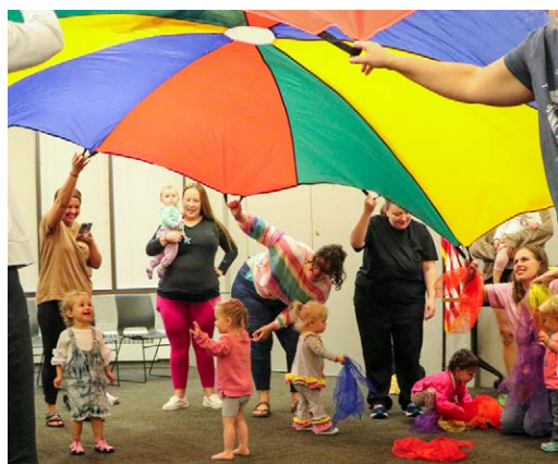
(Above) Children 2 and under enjoyed a special storytime event just for them. (Below) Children visit a Library booth during a pop-up park outreach event.