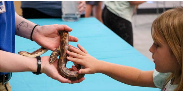
The Great Plains Zoomobile attracted hundreds of attendees to see animal ambassadors up close and personal.