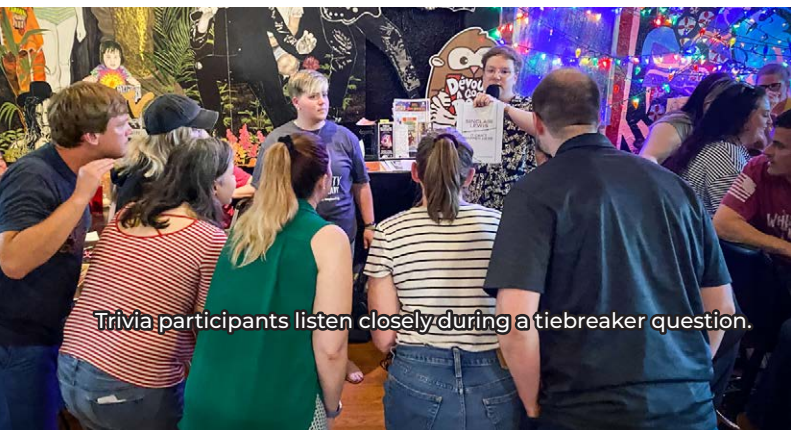
Trivia participants listen closely during a tiebreaker question.

Participants could earn badges by reading, visiting a Library location, reading a book from a book club, downloading an eBook on Libby, reading book recommendations from Check It Out on KWIT, or checking out different Library media. Suggested reads to earn badges were featured in Library displays.