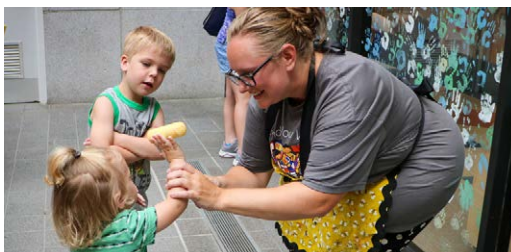
Children helped create the Summer Reading window mural during kickoff at the Aalfs Downtown Library by stamping their painted hands on the window in the atrium.

All Summer Reading events and activities were free and open to the public. 375 attendees joined the Library for the Summer Reading Kickoff event at the Aalfs Downtown Library enjoyed crafts, karaoke, and added their handprint to our summer window mural.