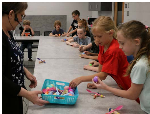
Imagination Builders select components for creating spoon catapults.