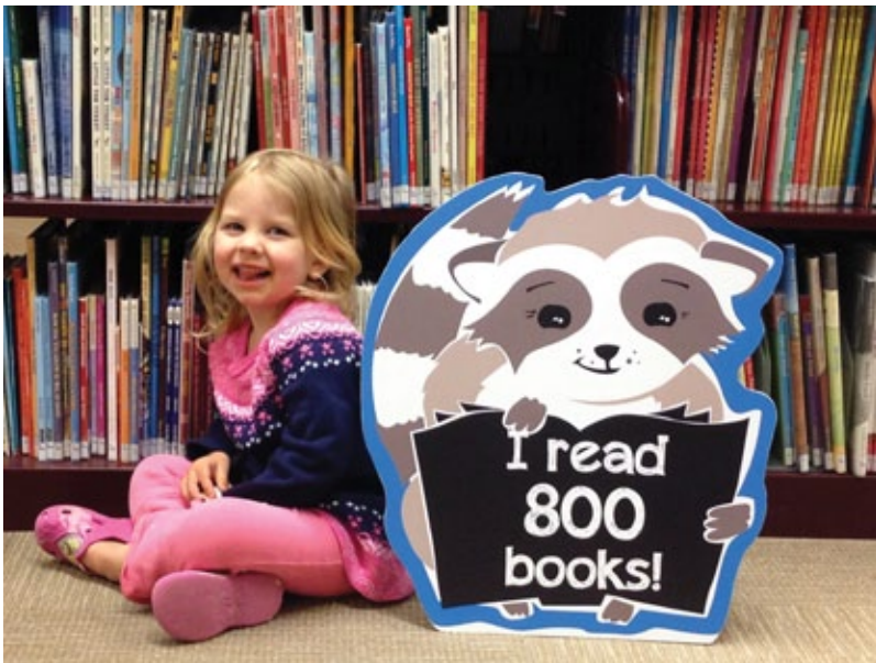
Ainsley smiles as she celebrates her 800-book milestone. She was also the first participant to reach the 1000-book milestone.

Sioux City Public Library launched the 1,000 Books Before Kindergarten challenge in January 2017, helping families prepare their children for kindergarten through the simple and enjoyable act of sharing books. Research shows that children who hear at least 1,000 books before kindergarten have wider vocabularies and are better prepared for kindergarten with the skills they need to succeed. Over 100 youngsters are participating in the challenge and 62 have reached milestones with eight having received their 1000-book medal.