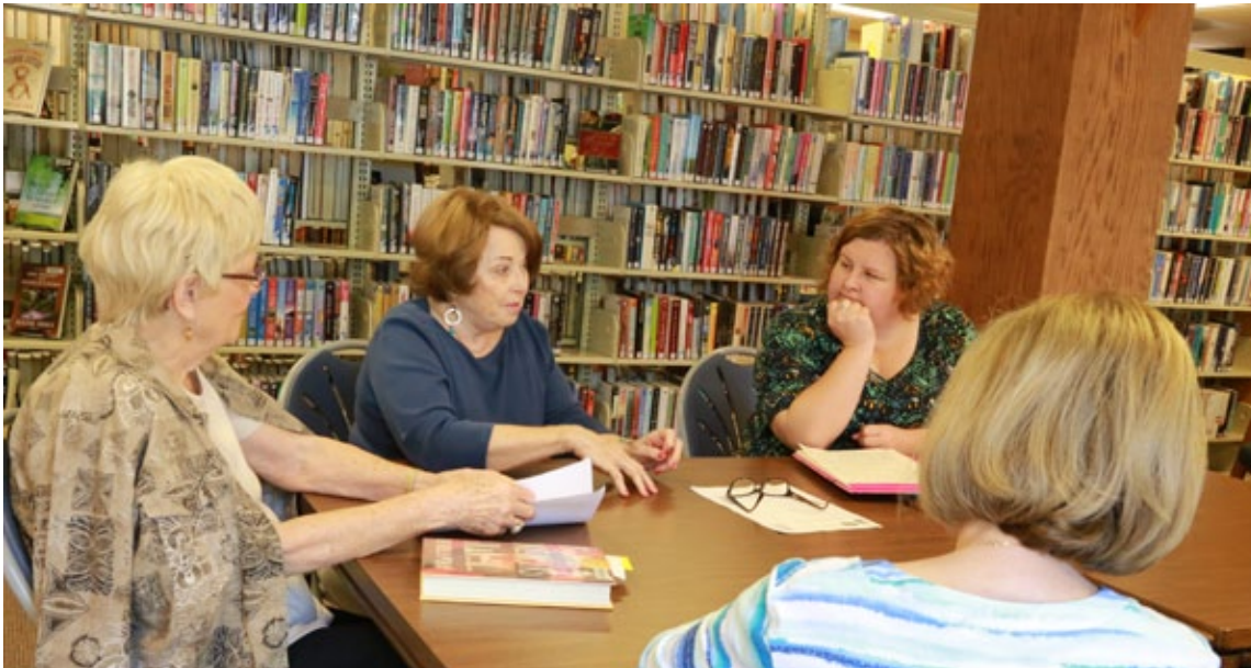
Open Book Club meets at the Perry Creek Branch to discuss Valient Ambition: George Washington, Benedict Arnold, and the Fate of the American Revolution by Nathaniel Philbrick.

Between January and November, reading enthusiasts meet for a lively book discussion the first Monday of each month in the morning at Perry Creek Branch Library and evenings at the Morningside Branch Library. Among others, the group read popular titles such as the worldwide bestseller A Man Called Ove by Fredrik Backman, and Behold the Dreamers by Imbolo Mbue which was announced as Oprah's 2017 Summer Book Club pick.